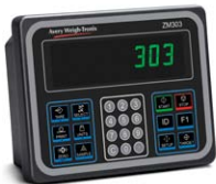
Aluminium Enclosure IBN Display