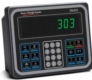
Tabletop Aluminium Enclosure

In addition to quick, easy and functional models suitable for use in all environments, the 304 brushed stainless steel models also include a swivel stand for adjustable viewing angles and provision for mounting onto a wall, desk, or column.