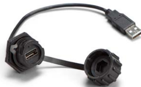
Watertight Gland - USB