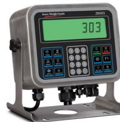
Stainless Steel Enclosure TN Display