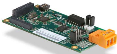
Analog Output Card 0-10 VDC and 4-20 mA.