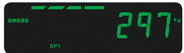
Multi-segment display for checkweighing and process control applications

The durable construction used for the ZM keypads offers strength, durability and chemical resistance, with metal domed tactile feedback to enhance usability.