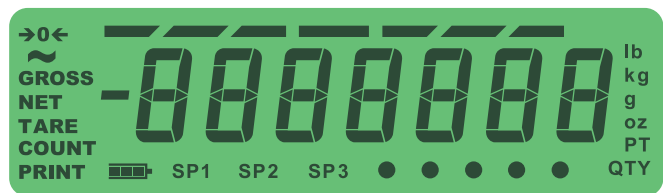
TN Display Ideal for outdoor use (ZM303 only)