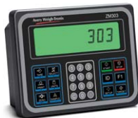
Aluminium Enclosure TN Display