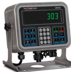
Stainless Steel Enclosure IBN Display