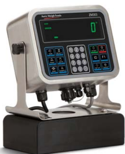
External Battery Pack Attachable external battery pack with toggle on/off. Uses four D batteries providing 12 hours operation on a single weight sensor system and 11 hours on a four weight sensor system.