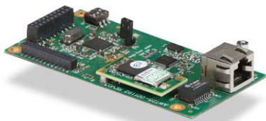
Wireless Internal Card 802.11 b/g Wireless