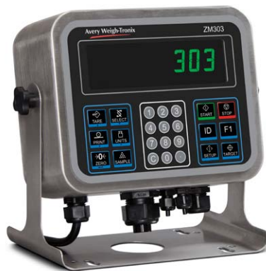
Stainless Steel Enclosure IP69K