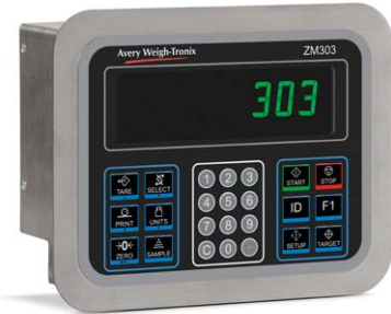
Stainless Panel Mount Enclosure