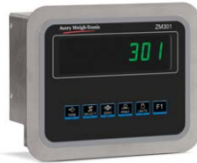
Stainless Panel Mount IBN Display