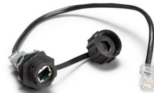
Watertight Gland - Ethernet