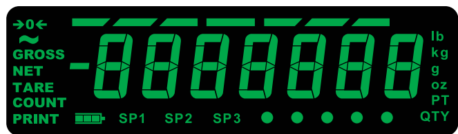
IBN Display Ideal for indoor use

For lower operator fatigue in direct sunlight conditions, the ZM303 is available with a TN LCD display. This technology features dark digits against a lighter background and a green backlight that is easy on the eye, making it suitable for use both in direct sunlight and during the evening or winter months when the light starts to dim.