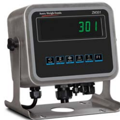
Stainless Steel Enclosure IBN Display