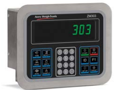
Stainless Panel Mount IBN Display