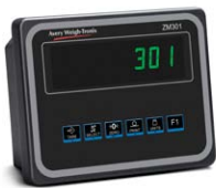
Aluminium Enclosure IBN Display