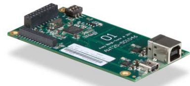
USB Device Card Provides USB interface to PC.