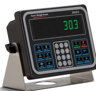
Tabletop Stand Kit For aluminium enclosure models.