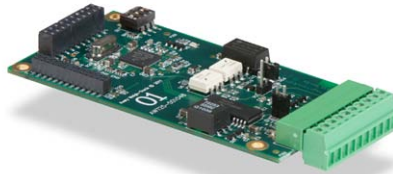
Current Loop Card Current Loop/RS485/RS422.