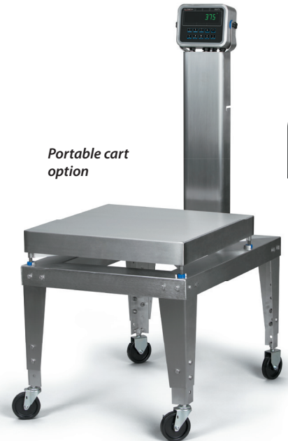
Portable cart option