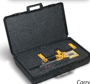
Carry case included

Dillon also manufactures highly accurate electronic and mechanical dynamometers and crane scales.