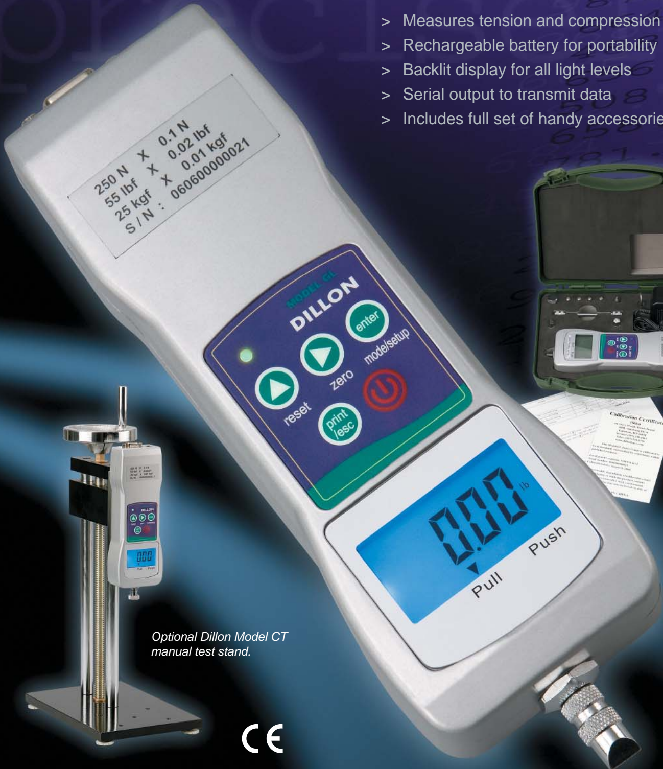
Optional Dillon Model CT manual test stand.